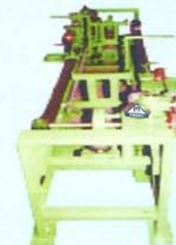
V-BELT TRIMMING MACHINE