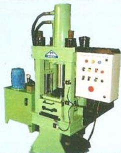
COIR PRODUCT-DOWNSTROKE PRESS