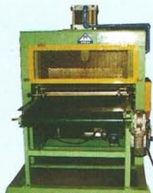
ADVANCED AUTO SHEET CUTTING WITH CONVEYER