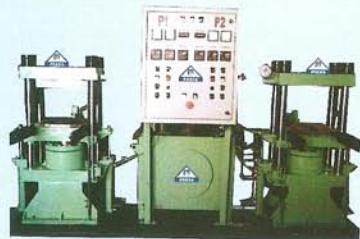
PRESS WITH SLIDE IN-OUT & JACK