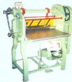
AUTO SHEET SLITTING MACHINE