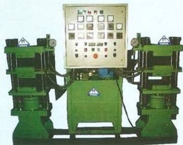
TWIN PRESS - TWIN DAY LIGHT