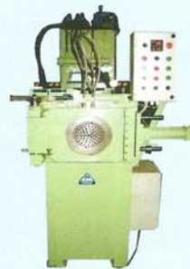
AUTO HYDRAULIC RUBBER STRAINER