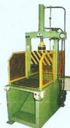
AUTO HYDRAULIC BALE CUTTING MACHINE